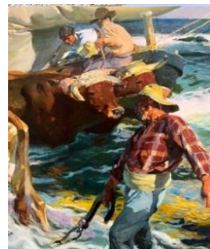
"Afternoon Sun" (Detail)