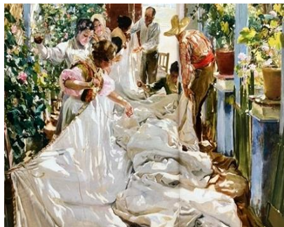
"Sewing the Sail"

Joaquin Sorolla (1863 – 1923) Spanish master of capturing the fleeting effects of sunlight.