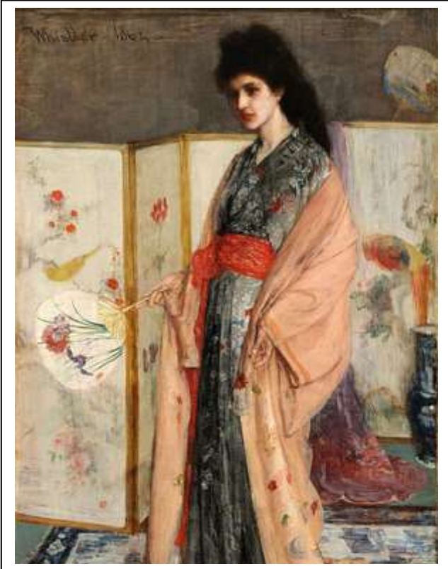
THE PORCELAIN PRINCESS OIL ON CANVAS 1864 JAMES ABBOT MCNEIL WHISTLER