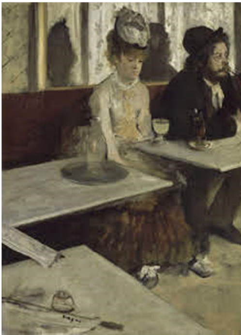
"IN A CAFÉ" Edgar Degas 1876 Oil on Canvas